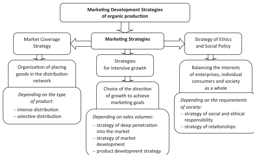
Figure 2. Model of formation of a marketing strategy for the development of organic production in the Ukraine