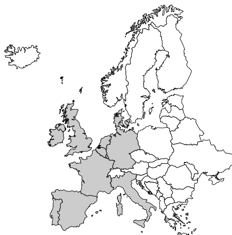
Fig. 2. Geographic scope of the butter market in 2013

(approx. 26% of worlds' production) and consumption at the level of 1.50 million t, with the relatively small amounts of export and imports. So, the geographical scope of the butter market is much broader than the domestic one. Indeed it could be defined as regional (in the broad sense), namely European. Two years later, in 2015 (the first year of milk quota system abolition) the spatial dimension of butter market was broadened by covering not only Germany + six European countries but also one country from other continent, namely United States. This market represents