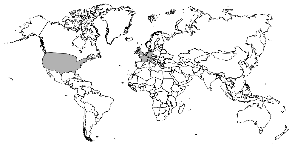
Fig. 3. Geographic scope of the butter market in 2015

Source: Own elaboration on basis of: CDIC [2017], Eurostat database, FAO database, UN Comtrade database.