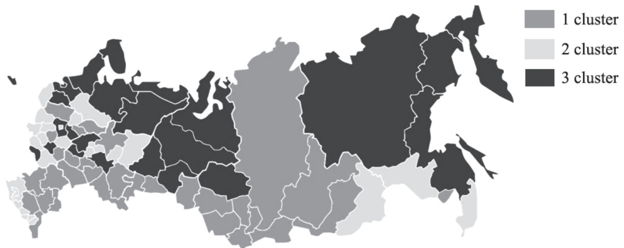
Fig. 3. Localization of clusters in Russian Federation

Additional indexes show the lowest amount of government support in the regions from the cluster 1 but at the same time only these regions have positive profit margin 0.4% without subsidies and 18.89% including subsidies. The cluster 3 having the biggest amount of government support has the highest profit margin 18.89%. However, estimations of physical indexes (wheat crop and mineral fertilizer amount) and earning power of holdings in terms of particular areas such as plant breeding and animal breeding point out that holdings from the cluster 2 are obviously leaders. It might be result of investments in particularly plant breeding and animal breeding as the amount of subsidies is the biggest one in this cluster.