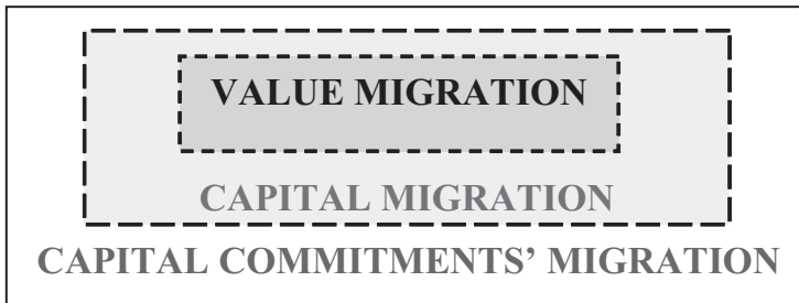
Fig. 1. Value migration, capital migration, and capital commitments' migration